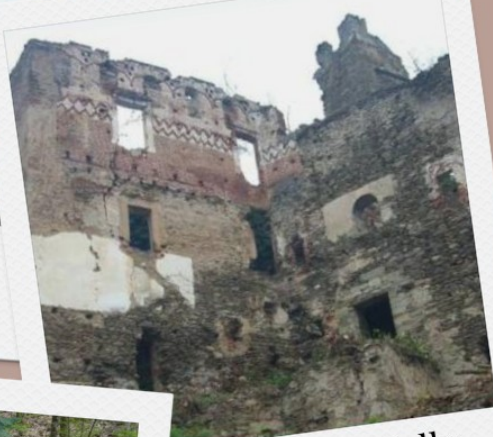
rovine del castello